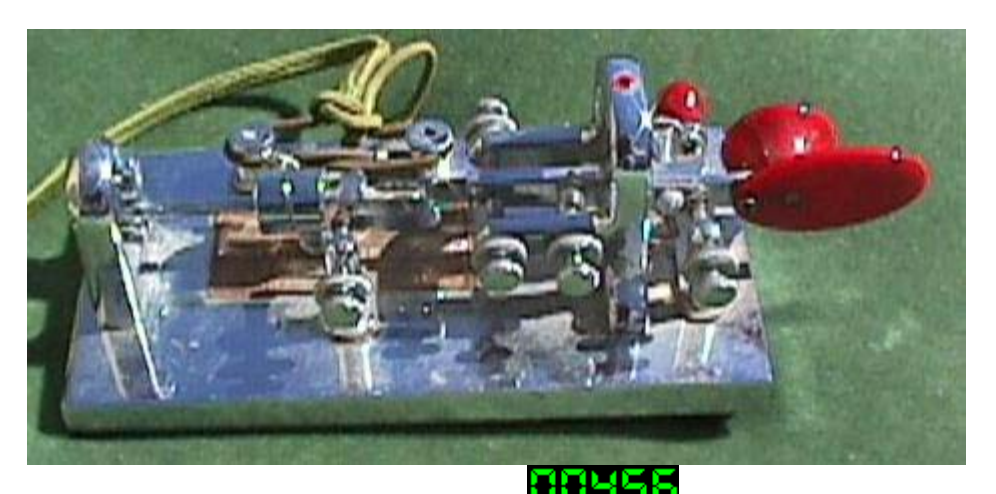
Free Counters powered by Andale!